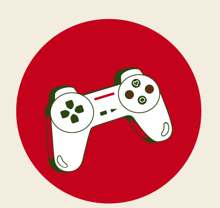
TYPE OF FRIEND GAMER