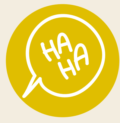
TYPE OF FRIEND GOOD SENSE OF HUMOUR