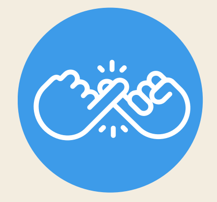
IMPORTANT OTHER TRUSTWORTHY