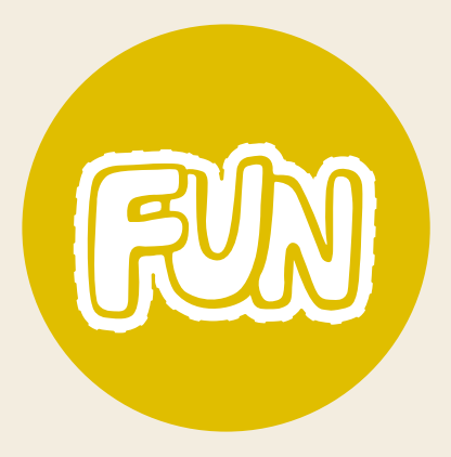
RELATIONSHIP WITH FAMILY – FUN